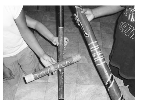
Boys can play the didgeridoo by blowing into it to make a sound.

To create music, boys and girls can play didgeridoo and clap sticks together.